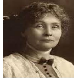
Emmeline Pankhurst Famous for helping woman win the right to vote.