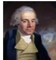
William Wilberforce Famous for influencing the Transatlantic Slave Trade.