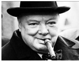
Winston Churchill Famous for leading Great Britain to victory in World War 2.