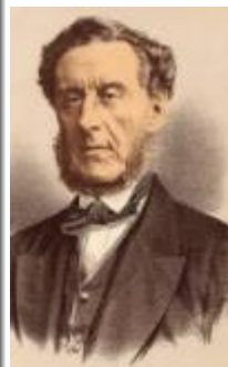
Lord Shaftesbury Famous for his contribution to changing working conditions for children.