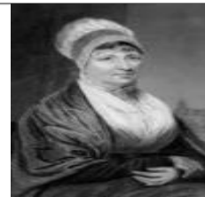
Elizabeth Fry Famous for changing conditions for prisoners.